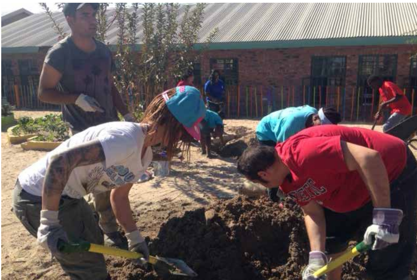
AVID (Classic Wallabies Exchange) volunteers building keyhole gardens at a Children's Eco Training School in the Greater Acornhoek region, South Africa.