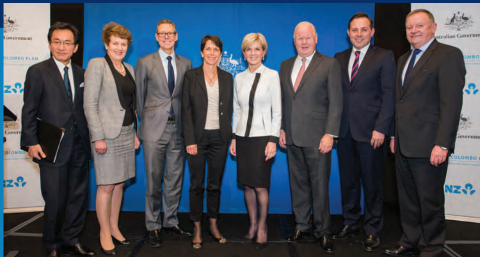
The Minister for Foreign Affairs with some of the inaugural Business Champions at the launch of the NCP business program.

The Hon Julie Bishop MP MINISTER FOR FOREIGN AFFAIRS