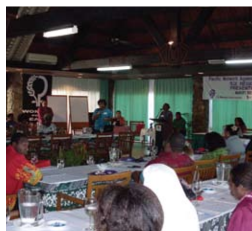
The fifth meeting of the Pacific Women's Network Against Violence Against Women was held in Fiji in June 2009.

AusAID is a contributor to the UNIFEM Pacific Facility Fund in Support of Organisations and Actions to End Violence Against Women. The fund was established to support government and civil society organisations working to end violence against women in the Pacific. Staff from AusAID's regional hub in Suva will be part of a Donor Steering Committee to oversee its operation. The committee will meet on a regular basis to receive feedback on the operation of the fund and to provide guidance on the fund's administration. By drawing on the expertise and knowledge of donors, UN agencies and regional NGOs, the fund will contribute to increased coordination as well as sharing of knowledge and good practice across the region.