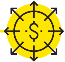
India's scale and frugal innovation