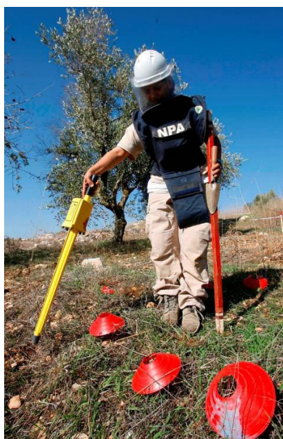
Searching for hazards.

Lebanon is a state party of the Convention on Cluster Munitions and Australia’s support is assisting Lebanon to meet its obligations under the Convention to clear and destroy cluster munitions. Australia also committed funding to assist Lebanon in hosting the Second Meeting of State Parties of the Convention on Cluster Munitions, held in Beirut in September 2011. It is hoped that Lebanon will be free of cluster munitions by 2015.