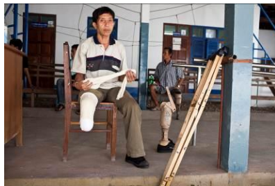
A man being waiting to be fitted with a prosthesis in Laos.

Australia's support will ensure continuation of essential rehabilitation services for people with disability in the Lao PDR. It will provide ongoing capacity building in clinical rehabilitation skills, meet essential costs for patients and materials, upgrade facilities to meet increasing demand for services and improve access to services through outreach clinical referral.