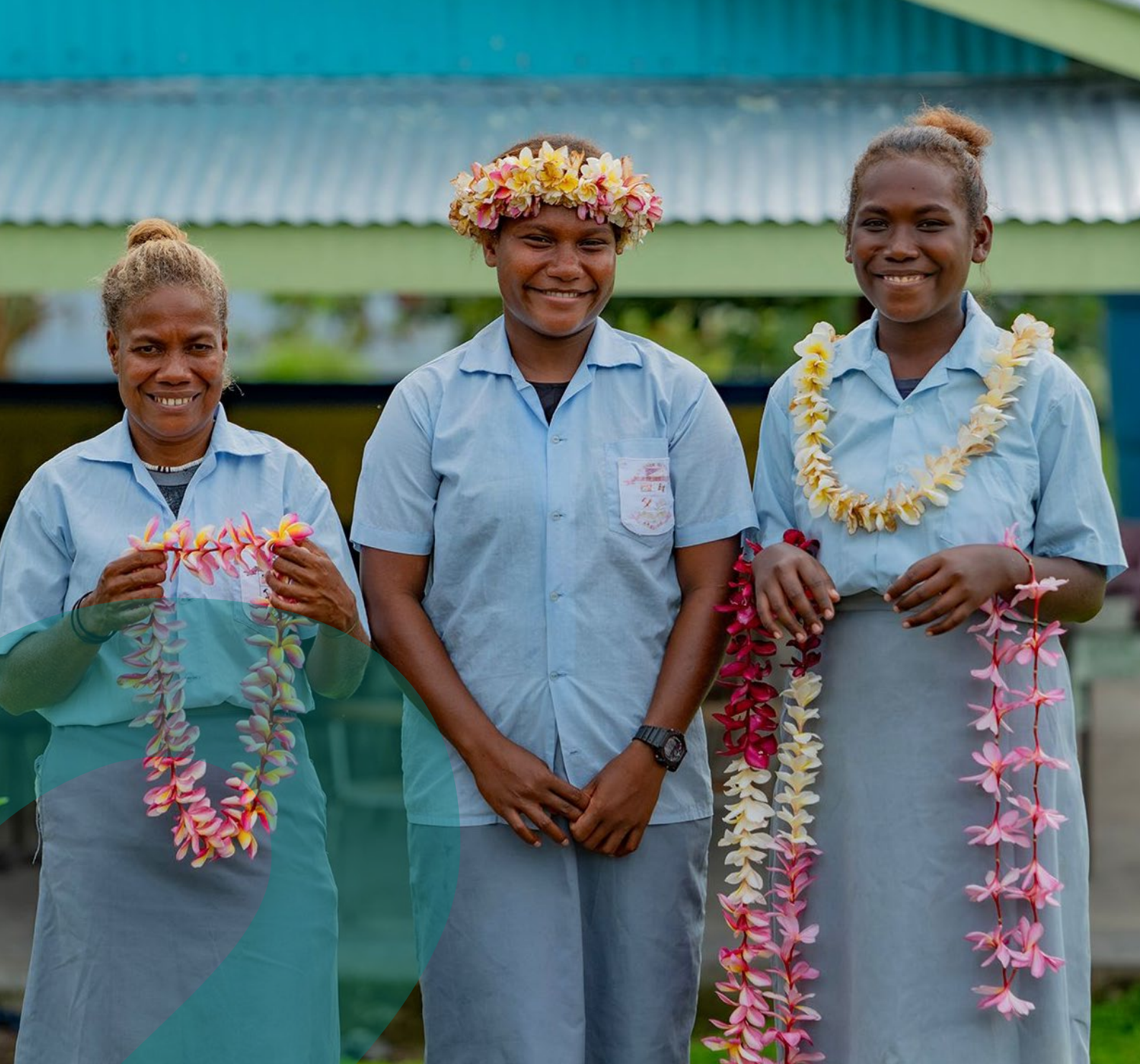
San Isidro Care Centre program participants, West Guadalcanal, Solomon Islands.