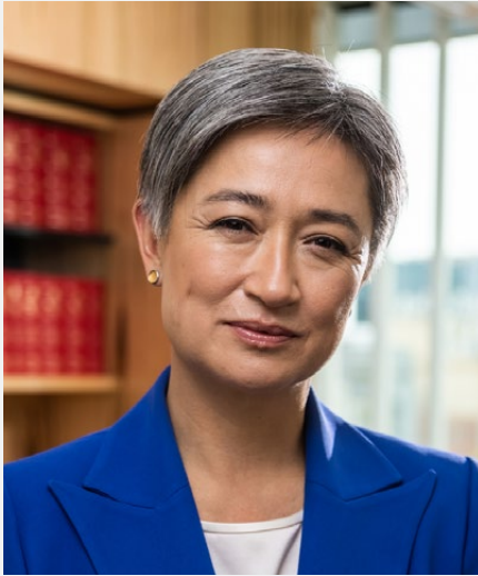
Senator the Hon Penny Wong