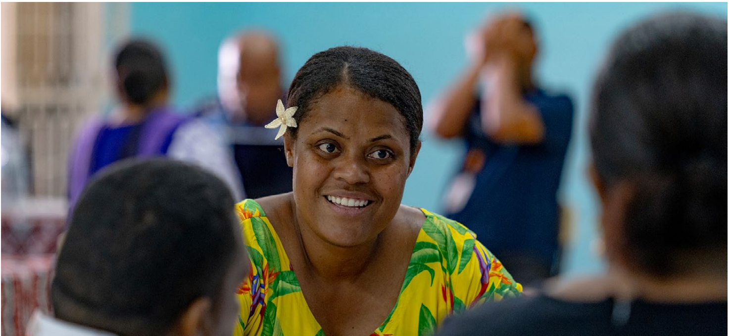
International Disability Equity and Rights Strategy consultations in Suva, Fiji.

Australia's approach to disability equity and rights will be guided by a commitment to partnership, respect, listening and learning. We believe the voices, needs and aspirations of people with disability should be at the centre of everything we do, and we are strongly committed to leaving no one behind. Our approach will be underpinned by five key concepts.