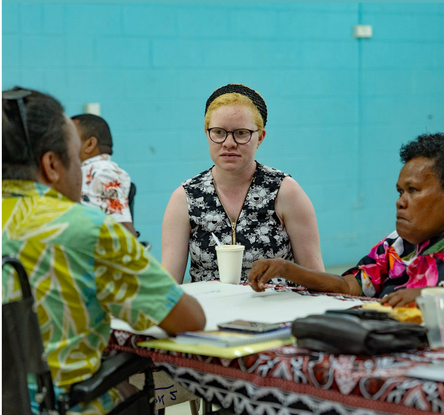
International Disability Equity and Rights Strategy consultations in Suva, Fiji.

A fairer, more equitable world in which people with disability are valued members of the community with equal rights, dignity, and the support they need to achieve equal outcomes