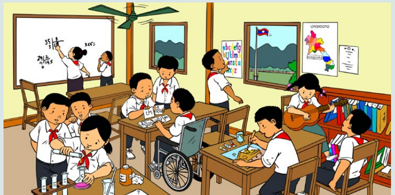
BEQUAL works with organisations of people with disability to develop learning resources for teachers that feature stories and images of people with disability, such as this textbook illustration.

Australia and Laos are working together to ensure primary education is inclusive of all students and teachers. The Basic Education Quality and Access in Lao PDR program supports the Lao Ministry of Education to promote disability equity and rights through the new primary school curriculum. For the first time in the country’s history, curriculum materials feature stories and images of people with disability that highlight their strengths and contributions at home, at work, and in the classroom. By challenging harmful stereotypes and stigma about disability, the new curriculum is paving the way for a more equitable and accessible future for all Lao students.