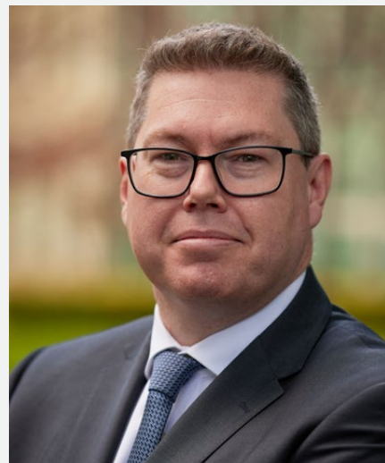
The Hon Pat Conroy MP

Together, we are committed to a fairer, more inclusive Indo-Pacific in which disability equity uplifts all.