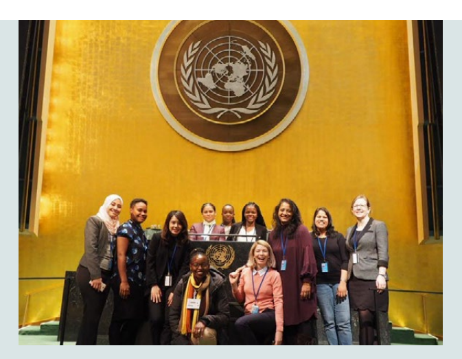
Women in Cyber Fellows in the UN General Assembly.

On average, just 27 per cent of speakers in peace and security debates are women.<sup>28</sup> The Women in International Security and Cyberspace Fellowship, co-funded by Australia, has increased women's participation in UN peace and security discussions, including women from more than 40 countries who have built multilateral negotiation and cyber policy skills. As a result, in December 2023, the UN Open-Ended Working Group on Cyber was the first UN peace and security forum to achieve gender parity, with 55 per cent of interventions made by women speakers.