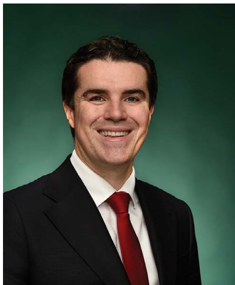
The Hon Tim Watts MP

Assistant Minister for Foreign Affairs of Australia