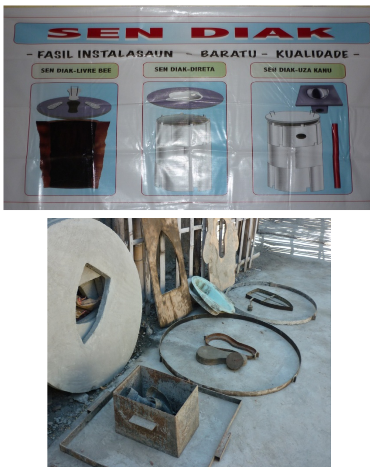
Figure 4: Toilet designs promoted by a local sanitation enterprise

The evaluation team questioned whether the breadth of toilet design options (in particular dry options) 31 and the technical expertise made available to communities was sufficient.