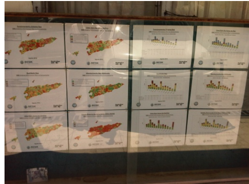
Figure 2: Publically displayed SIBS data

Notwithstanding the recognised value provided by SIBS at this point, BESIK II will be required to provide considerable on-going support to ensure that the system endures. At the time of this review, the full cycle of data capture, analysis and dissemination had only been running for a few months. The ongoing maintenance and operation of the technology carries obvious risks and challenges in the Timor Leste context. But perhaps greater challenges arise from the need to institutionalise processes that assure the quality and integrity of data; and to institutionalise the use of information to inform planning and decision-making 12 . Without the reliable supply of accurate and timely data, leadership support for SIBS will wane, and the esteem derived by DNSA managers from having relevant information at their ‘fingertips’ will dissipate. This in turn will squander the significant investment made by BESIK and will reinforce disappointing global experience in the information communication technology for development (ICT4D) sector.