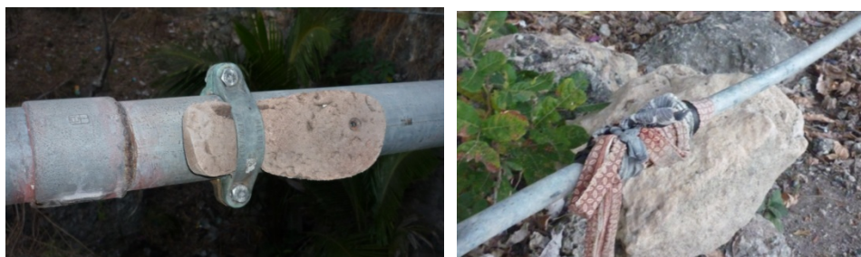
Figure 5: Poor maintenance capacity erodes system functionality and sustainability

Second, although GMF members generally appreciated the training provided by BESIK and expressed confidence in their ability to perform core functions; this was frequently accompanied by requests for further training and support. The issue of maintenance capacity seemed especially important, and was borne out in field observations, as depicted in Figure 5.