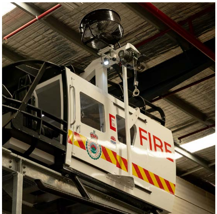
Above: VSS Hoist Module.