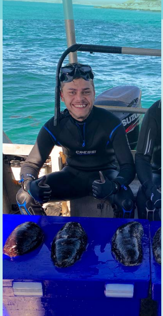
A diver harvesting sea cucumbers at Shark Bay in Western Australia.

We practise cultural directive training, not employment directed training. We look at the heritage of each candidate and enhance their skills through our program. If they are a saltwater person, their program is designed to increase their natural talents on the water and then adapt these skills to an industry standard. Once the participant passes this stage, the second stage is to achieve the required qualifications at a recognised training organisation and then the participant is ready to engage in commercial diving activities. Our retention rate is high, and we have a high impact in the community through the creation of employment pathways into a variety of industries.