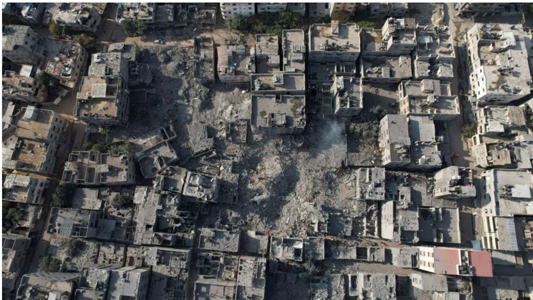
Site of Israeli strikes on houses in Al Bureij Camp in Middle Gaza, 2 November 2023.

At around 1330 hours, a massive explosion struck a residential block in Al Bureij Camp, Middle Gaza, which was similar to Jabalya Refugee Camp in population density. The strike impacted an area of approximately 6,000 square metres, destroying at least 12 buildings and severely damaging at least 9 others. OHCHR verified 15 people killed, including 5 women and 9 children, with information of an additional 7 fatalities. Based on the level of damage and the crater sizes, the strike likely involved at least four GBU-39s, suggesting attribution to the IAF. While smaller compared to the GBU-31, GBU-39s are expected to collapse buildings, such as those in Gaza, abruptly and in quick succession. The IDF has not mentioned Al Bureij Camp specifically before or after the incident. Several hours after the incident, the IDF stated that they “struck a number of military command and control centres used by senior Hamas terrorist operatives”, without making any specific reference to Al Bureij Camp. 15