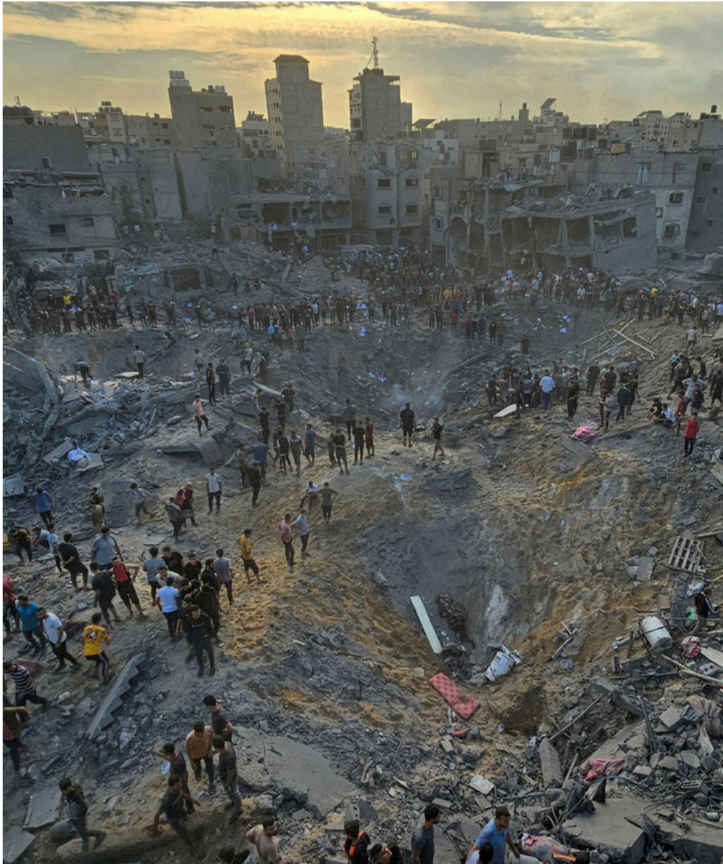
Palestinians search for casualties at the site of Israeli strikes on houses in Jabalya Refugee Camp in North Gaza, 31 October 2023.

level of damage and the crater sizes, the strike likely involved at least four GBU-32s, although the larger GBU-31 cannot be ruled out. The IDF confirmed that they had undertaken the strike, claiming to have “killed Ibrahim Biari, the Commander of Hamas’ Central Jabaliya Battalion”, who was allegedly involved in the 7 October attack. Additionally, the IDF stated that “a large number of terrorists who were with Biari were killed” and that the “underground terror infrastructure” beneath the ground “collapsed after the strike.” 14