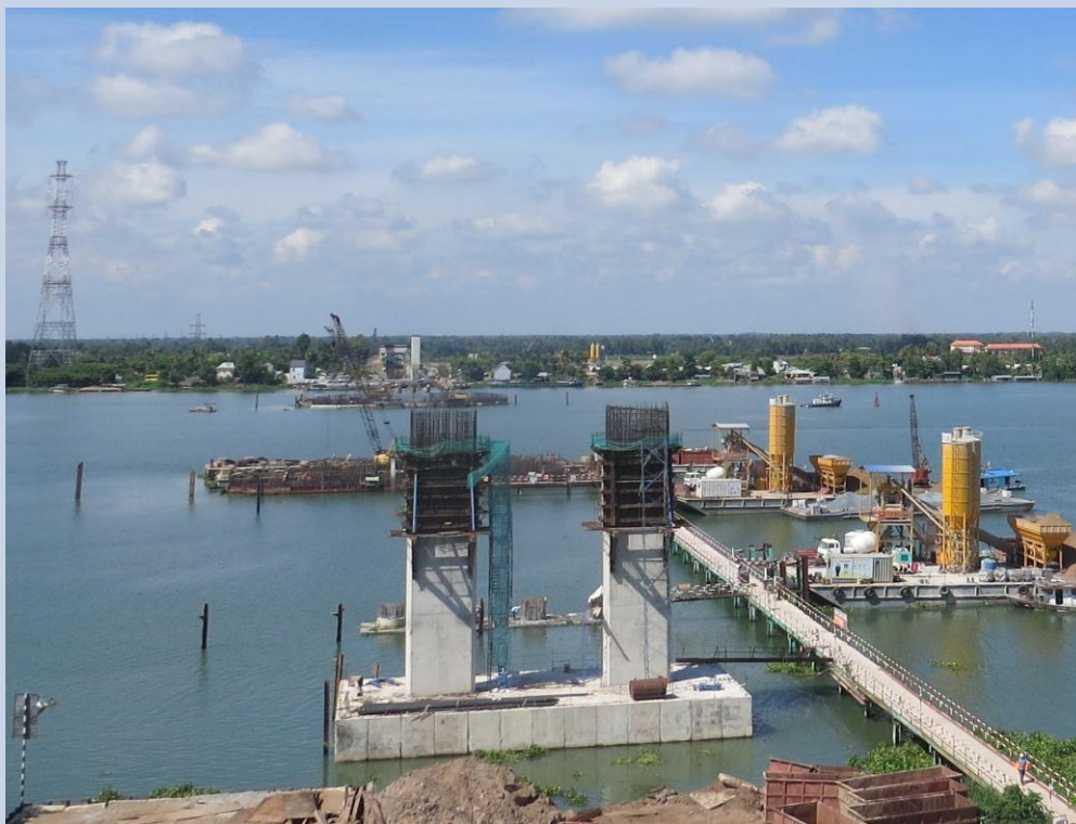
Construction of Cao Lanh Bridge.

Australia is also providing support to help Cambodia, Laos, Burma and Vietnam become more integrated through improved cross-border management and transit procedures, and exchange of traffic rights. These investments aim to unlock the economic benefits of transport projects such as the Cao Lanh Bridge in Vietnam, through addressing policy and regulatory barriers to trade, as well as improving private sector trading capacity. These initiatives include safeguards activities such as income restoration, and HIV/AIDs and human trafficking awareness and prevention.