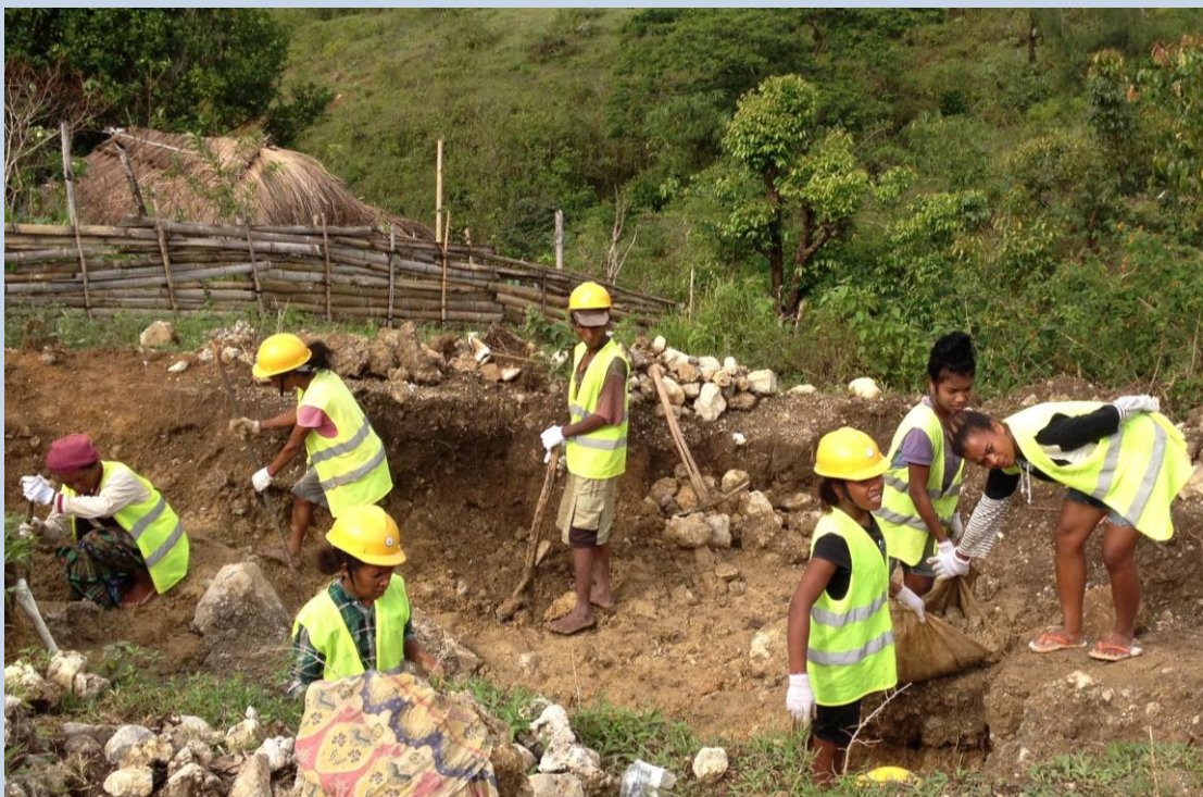
Women workers from a local community undertaking R4D rural road rehabilitation work in Lianai-Grotu road in Manufahi, Timor-Leste.

Gender is given a high priority in R4D’s objectives. It aims for 50 per cent for women’s participation in employment by 2016 and has achieved its minimum benchmark of 30 per cent. Nine (15 per cent) female–owned companies have been contracted. R4D has piloted innovative approaches to address constraints to women’s participation in the program such as trialling childcare arrangements for women wishing to work as labourers, integrating gender equality issues into the technical training course for road contractors, ensuring women fully participate in village meetings, and supporting female-owned companies to actively tender for work under the program.