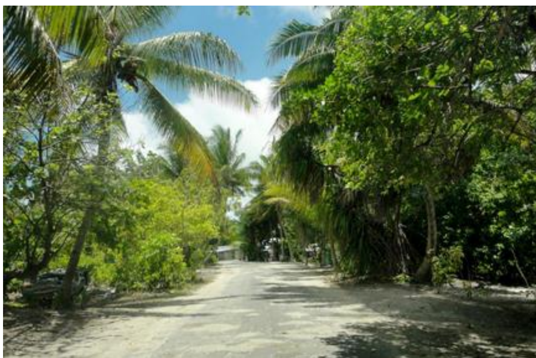
New roads in South Tarawa are more resilient to rising sea levels and tidal flows.

Assessments of potential impacts from climate change and actions to mitigate and adapt to these impacts should be undertaken for all DFAT infrastructure investments. Further information can be found in DFAT's Climate Resilient Infrastructure – Guidance Document .