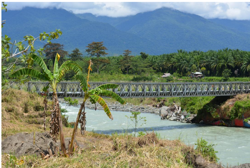
Bridge over the Kumusi River in Oro Province, Papua New Guinea.

The Strategy covers transport, energy, large-scale water and sanitation, and information and communications technology (ICT) infrastructure while excluding social infrastructure such as health and education facilities. Other DFAT sectoral strategies addressing infrastructure include: aid for trade; private sector development; agriculture, fisheries and water; health; and education.