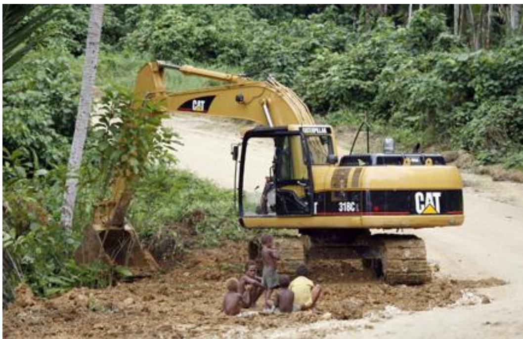
Building a road between Auki and Malu'u, Solomon Islands.

To date, Australia's bilateral infrastructure investments have focussed primarily on road transport. This will continue to be a priority, however, the aid policy requires us to explore opportunities in water, energy, communications and non-road transport infrastructure. Examples of areas we could support include maritime and aviation transport; energy generation and distribution (large scale as well as off grid systems in rural areas); and improving competition and regulation in the communications sector as we have in many countries in the region.