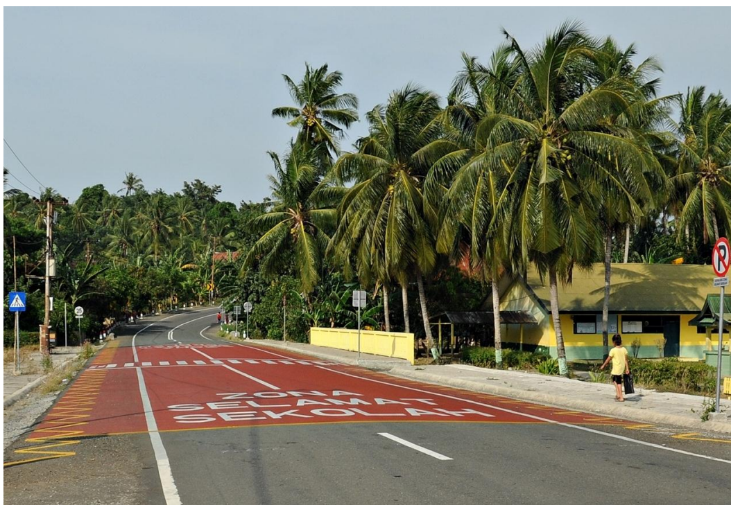
Safety signage outside school in Indonesia.

Safety should be at the forefront of all DFAT infrastructure investments. Of the approximately 1.2 million people killed in road traffic accidents in the world each year, over 90 per cent occur in low and middle-income countries with 60 per cent being in Asia 9 . Including safety at the design stage delivers better outcomes than retrofitting safety measures. All DFAT infrastructure programs should undertake safety assessments to minimise negative impacts for affected populations and to help manage the risks from our aid investments. Priority will be given to safer road design with all of our road programs implementing road safety plans for all roads we support.