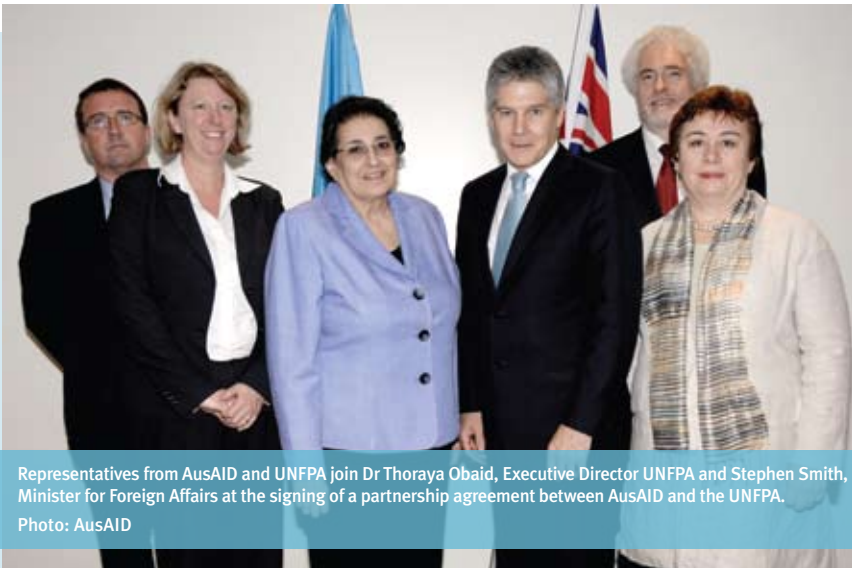
Representatives from AusAID and UNFPA join Dr Thoraya Obaid, Executive Director UNFPA and Stephen Smith, Minister for Foreign Affairs at the signing of a partnership agreement between AusAID and the UNFPA.

Gender equality and the empowerment of women are an essential part of this. A global partnership for development needs to involve men and women as partners and decision-makers, and to ensure that men and women benefit from the work of this partnership.