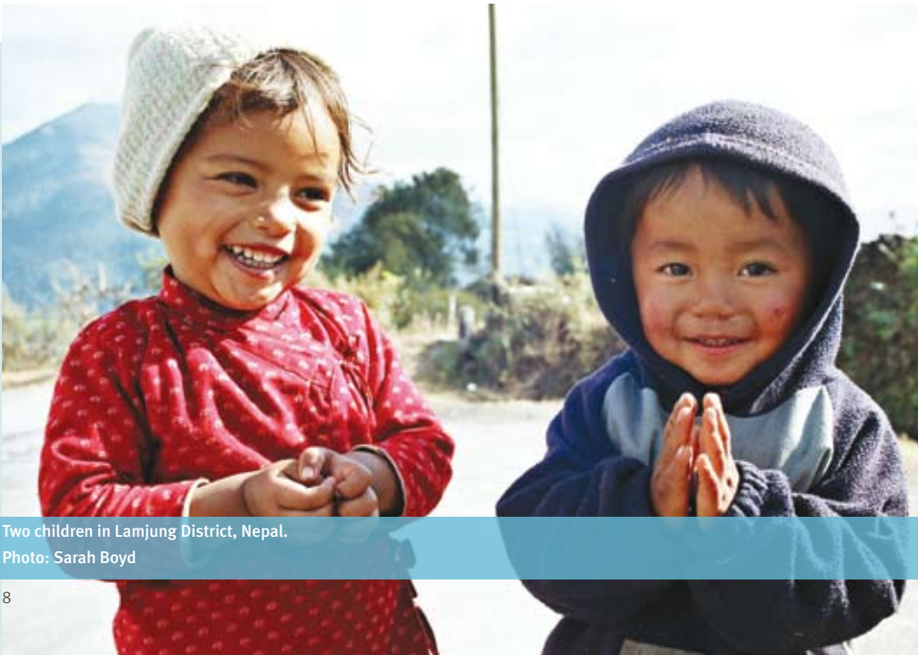
Two children in Lamjung District, Nepal.

In many places, a preference for sons can mean that girls do not have the same access to food and health care as their brothers, and so are more at risk of dying before their fifth birthday.