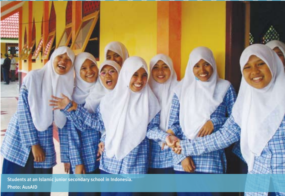
Students at an Islamic junior secondary school in Indonesia.