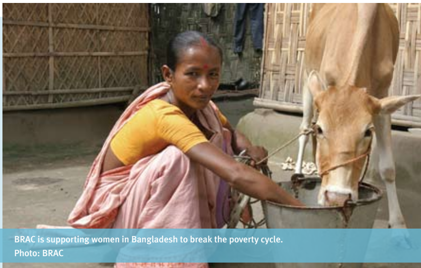
BRAC is supporting women in Bangladesh to break the poverty cycle.

By targeting women as part of efforts to eradicate poverty, children, families and communities also benefit.