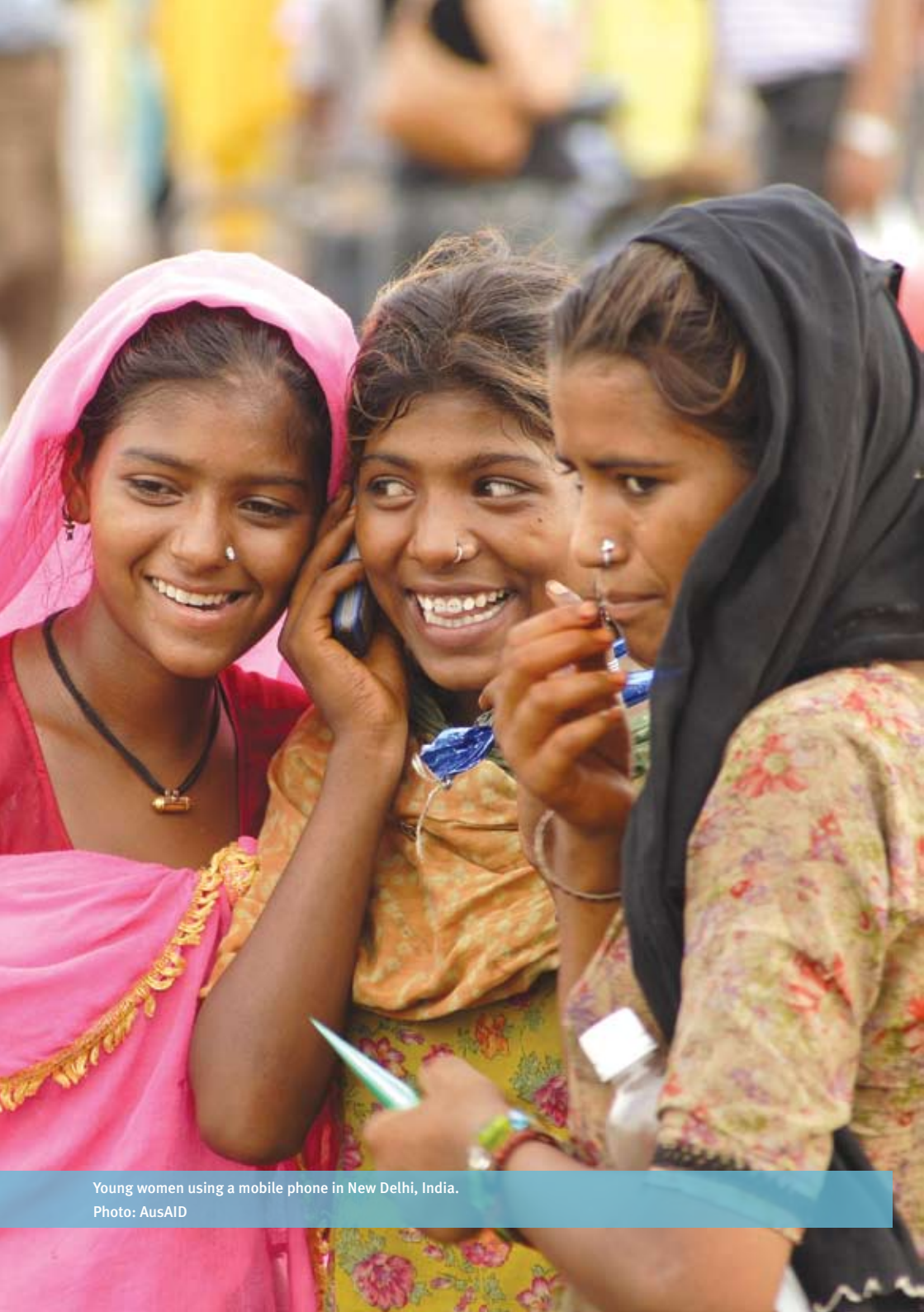
Young women using a mobile phone in New Delhi, India.