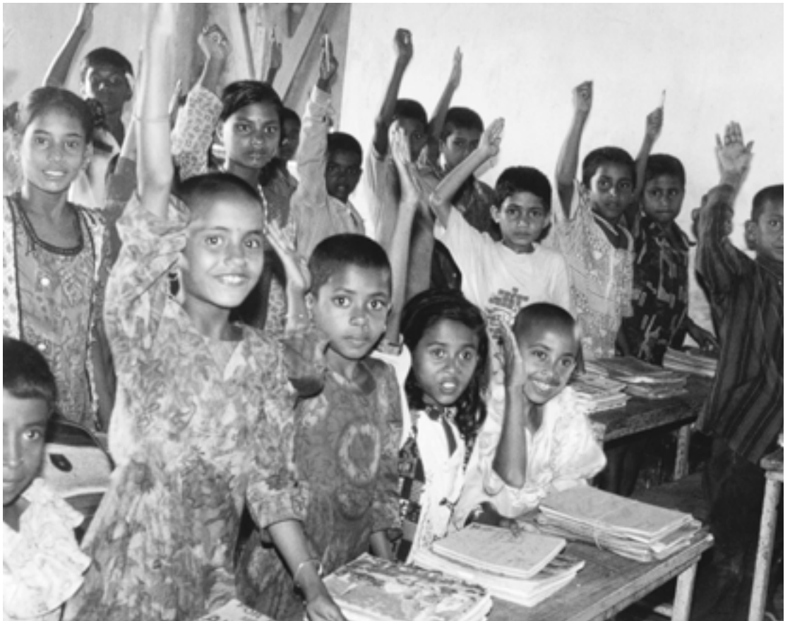
ABOVE: Thanks to a revolution in schooling practices through the IDEAL project, funded by the Australian Government since 1998, children – especially girls – are staying at school longer, and having a better chance in life.

In Pakistan female literacy rates in rural communities are as low as 2.4 per cent. For many girls, social and physical access to education remains a major problem. There are fewer schools for girls, fewer teachers to teach in girls schools, and sociocultural barriers that prevent the enrolment of girls.