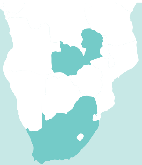
South Africa, Zambia

Australia assists developing countries through bilateral, regional and global initiatives that focus on mining for development. In 2010 and 2011 Australia delivered the following assistance.