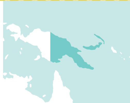
Papua New Guinea