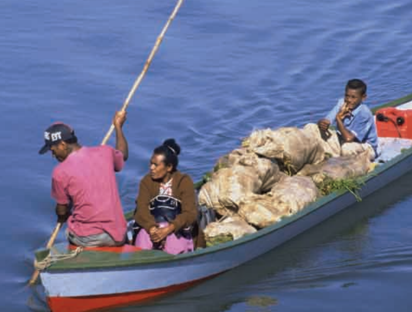
ABOVE Navua River, Fiji.