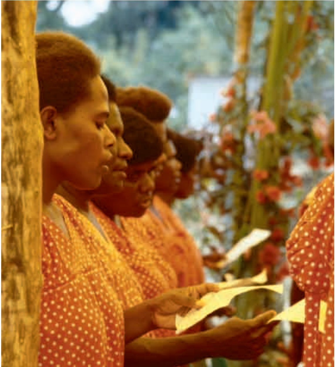
ABOVE Freshwind settlement choir, Vanuatu.