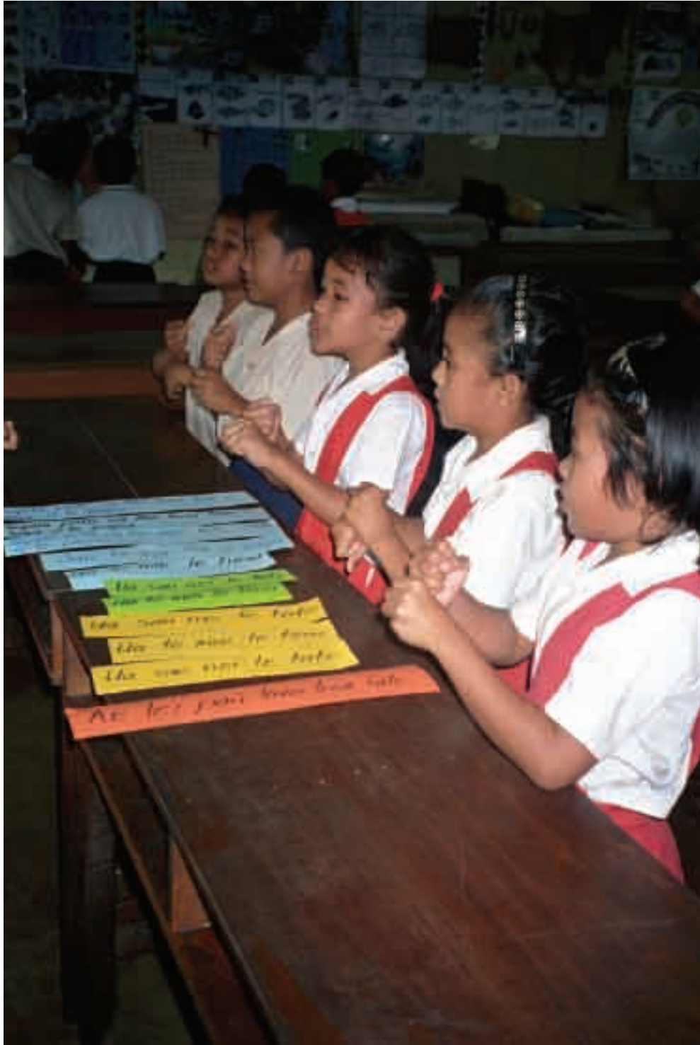
ABOVE Apia Lower Primary School, Apia, Samoa.