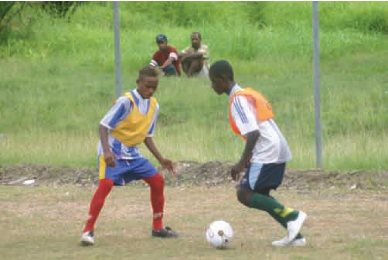
ABOVE Soccer practice, Honiara, Solomon Islands.