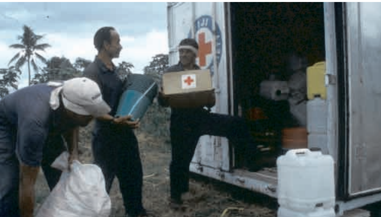
ABOVE Red Cross personnel loading emergency relief items.

A key issue in aid planning and impact measurement in the Pacific is the poor quality of valuable statistical data, particularly economic data. Considerable improvements in statistical services in the Pacific are required to support the planning and development of meaningful performance indicators and planning, especially in the key areas of health, education and informal sector economic activity. Australia is supporting a program through the Secretariat of the Pacific Community (SPC) to help governments understand the benefits of sustaining the production of appropriate statistics to ensure that statistical collections are better targeted and more timely.