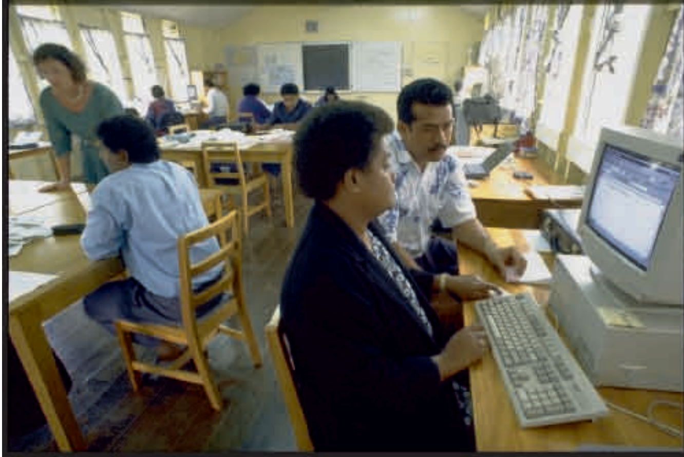
ABOVE Training session, Fiji.