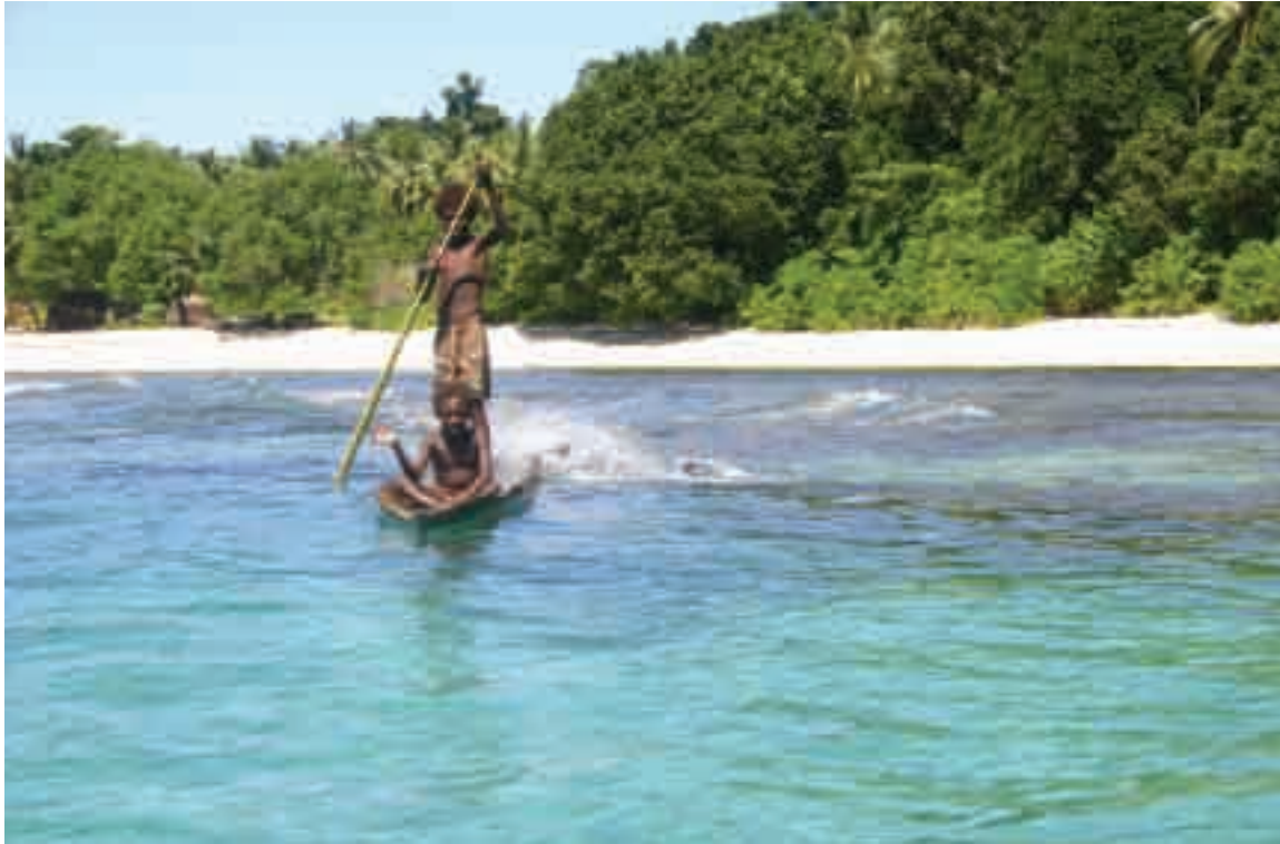
ABOVE Boys in a canoe, Solomon Islands.

education), regional dialogue (eg Secretariat of the Pacific Community), high level and program level dialogue on the bilateral aid program (eg annual High Level Consultations), consultations with other donors in the Pacific and activity identification, design and management processes.