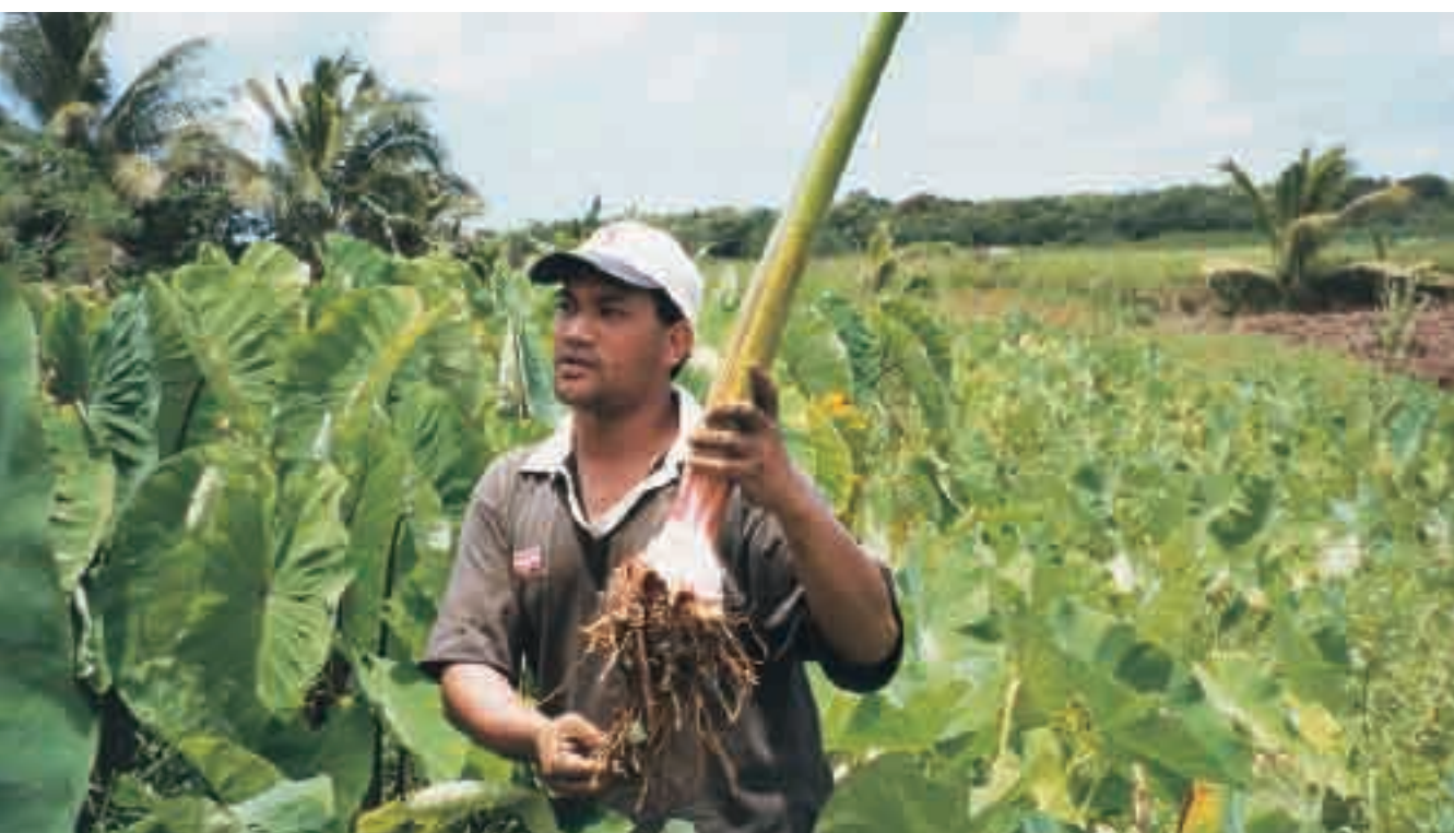
ABOVE Taro planter, Samoa.