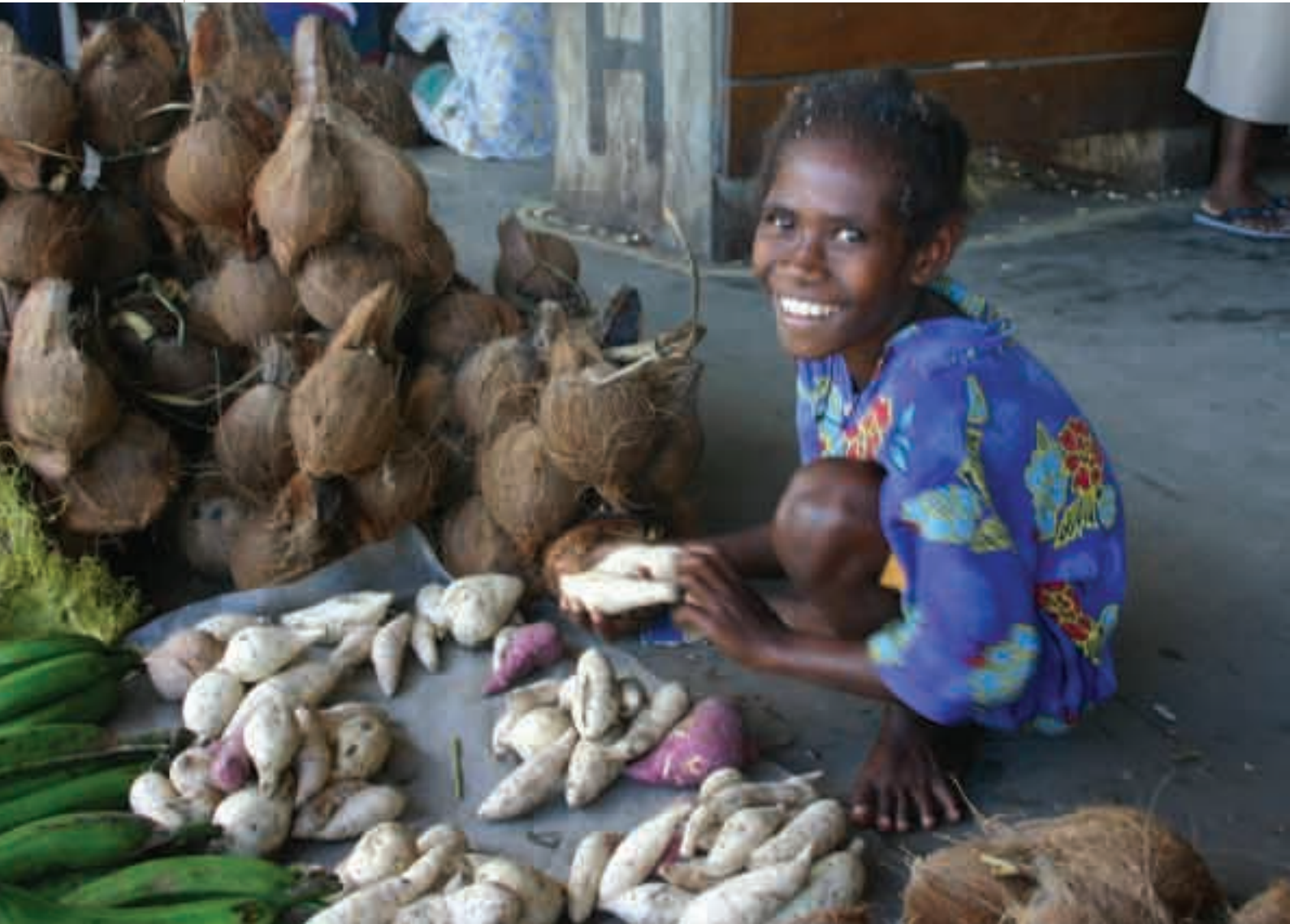
ABOVE Honiara market, Solomon Islands.