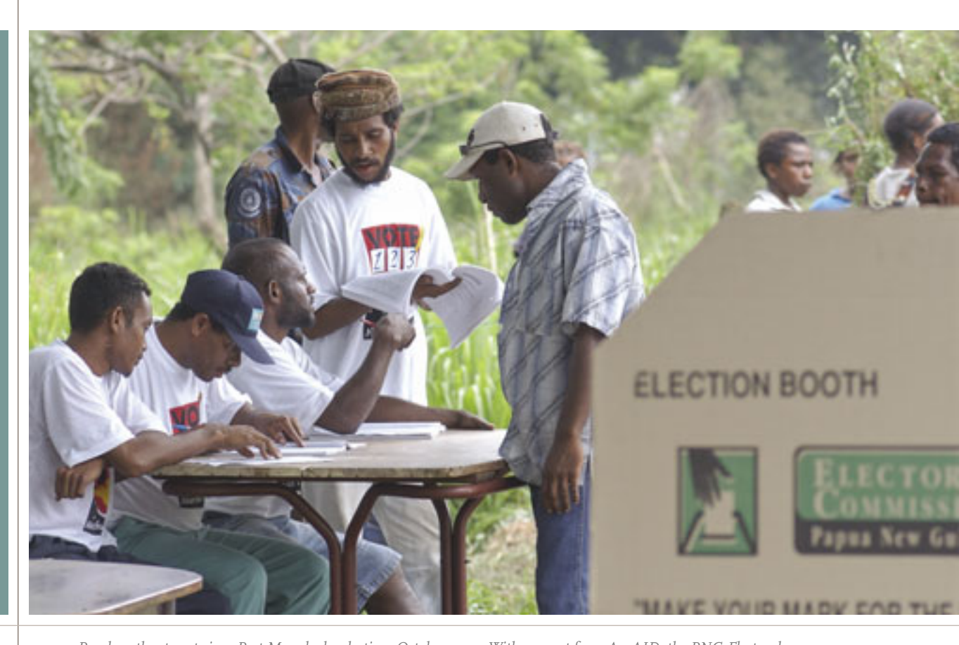
ABOVE: People gather to vote in a Port Moresby by-election, October 2004. With support from AusAID, the PNG Electoral Commission is working to improve the integrity of the electoral roll, heighten community awareness of electoral matters and strengthen electoral processes.

Australia will assist the PNG Government to fulfil its obligation to deliver core service delivery functions through a practical program of short-, medium- and longer-term public sector reform. This program, which will include an ongoing commitment to the