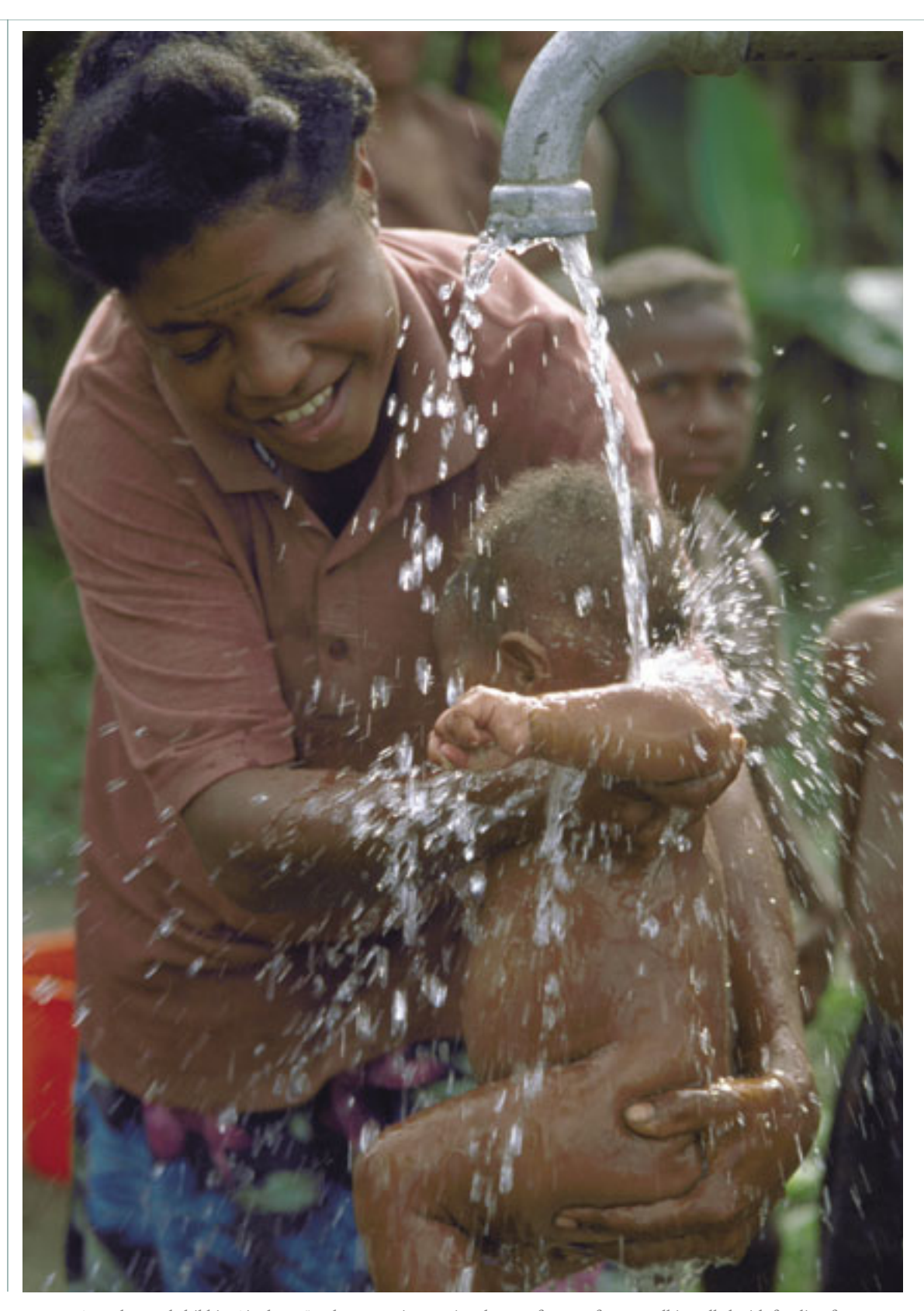
ABOVE: A mother and child in Aipokon, Sandaun Province, enjoy clean, safe water from a well installed with funding from Australia. The Australian Government has long recognised the importance of clean water as a cornerstone for development.