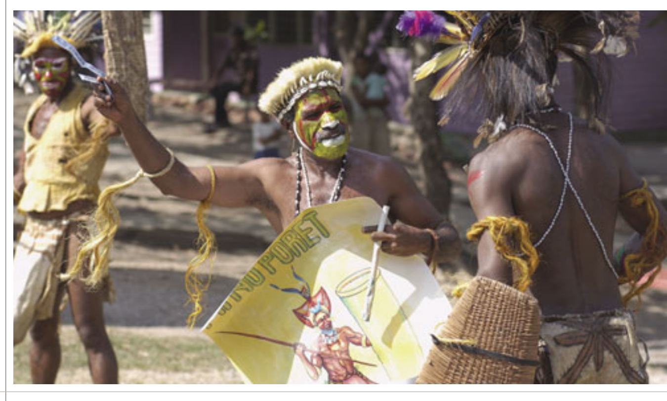
ABOVE: The Anglicare STOPAIDS theatre group is just one of the many non-government organisations across Papua New Guinea staging plays at local markets, schools, and other community meeting places to help inform and educate people about HIV/AIDS. This performance at Morata settlement in Port Moresby attracted a good audience.

There will be a joint Papua New Guinea – Australia mid-term review of the Development Cooperation Strategy, including a review of the Performance Review and Dialogue mechanism. The review will include an independent third party expert.