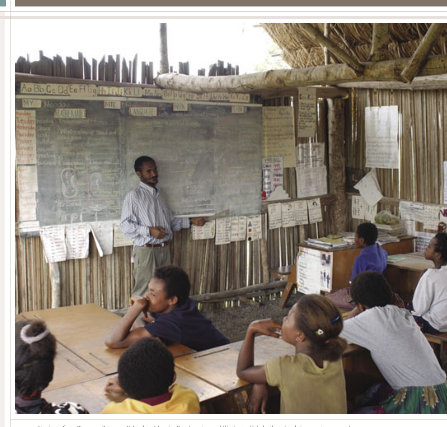
ABOVE: Students from Tararan Primary School in Morobe Province learn skills that will help them lead the way to economic growth and stability into the future. Essential textbooks and materials are provided to many schools within Papua New Guinea through the aid program.