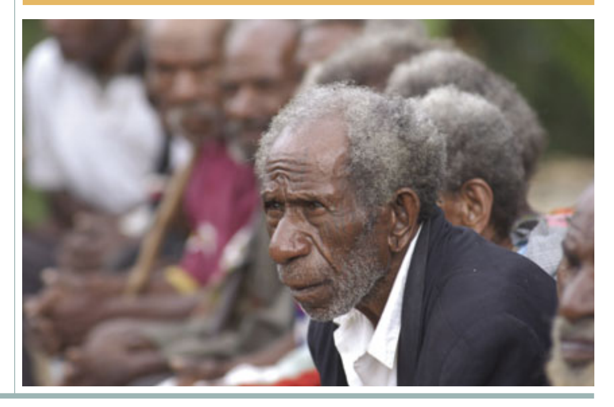
ABOVE: A village meeting in Simbu Province, Highlands. Village meetings are still the most popular vehicle for gauging public opinion throughout Papua New Guinea. Everyone, no matter how old or young, is given the opportunity at these gatherings to join in discussions that affect their community.

A brief discussion of MTDS and DCS policy alignment follows. Further details, including examples of possible interventions, are provided under the sections for each DCS pillar (1.5.1–4).