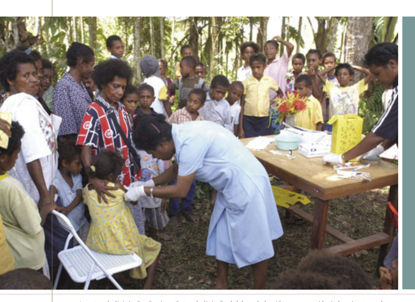
ABOVE: An outreach clinic in Oro Province. Outreach clinics funded through the aid program provide vital services to rural communities in Papua New Guinea.