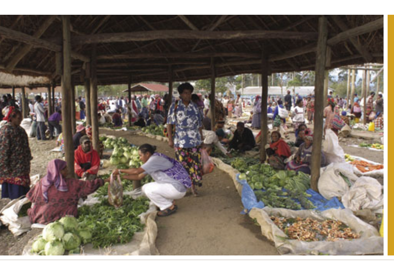
ABOVE: Income-earning opportunities are boosted by local markets where buyers and sellers meet to trade food crops and crafts. AusAID works closely with key partners throughout Papua New Guinea on projects to improve the standard of living and drive economic growth.

The key to reducing poverty levels will be sustainable, broad-based economic growth that leads to improvements in living standards of all Papua New Guineans including development indicators such as life expectancy, literacy and infant and child mortality. Projections for future economic growth rates are around 2.5–3 per cent per annum over the next few years, which is well below the 6–7 per cent