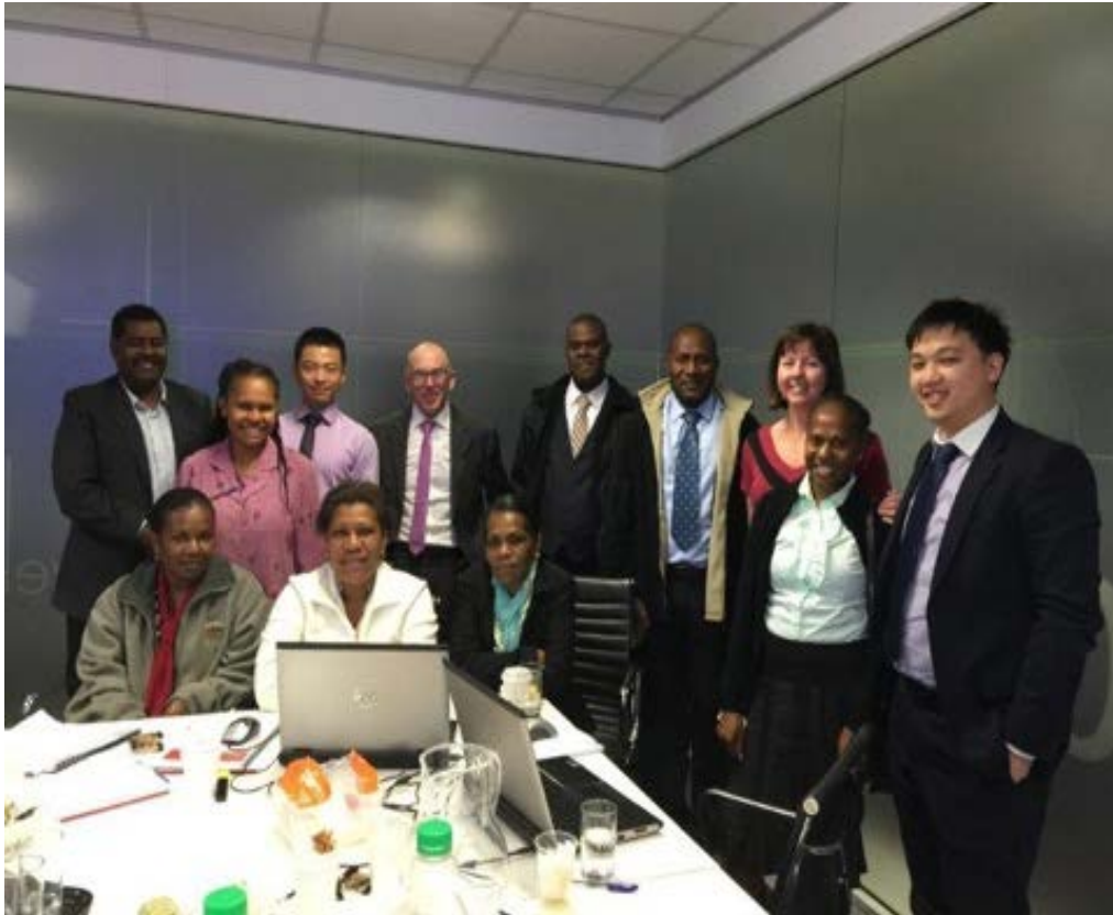
Justice Sector colleagues and trainers in Sydney at 'superusers' training. The training helped advanced users to better understand, and then tailor to their needs, the new case management systems at the Supreme Court and State Law Office.

Vanuatu Law and Justice Partnership Stretim Rod Blong Jastis part of Policing and Justice Support Program (Vanuatu)