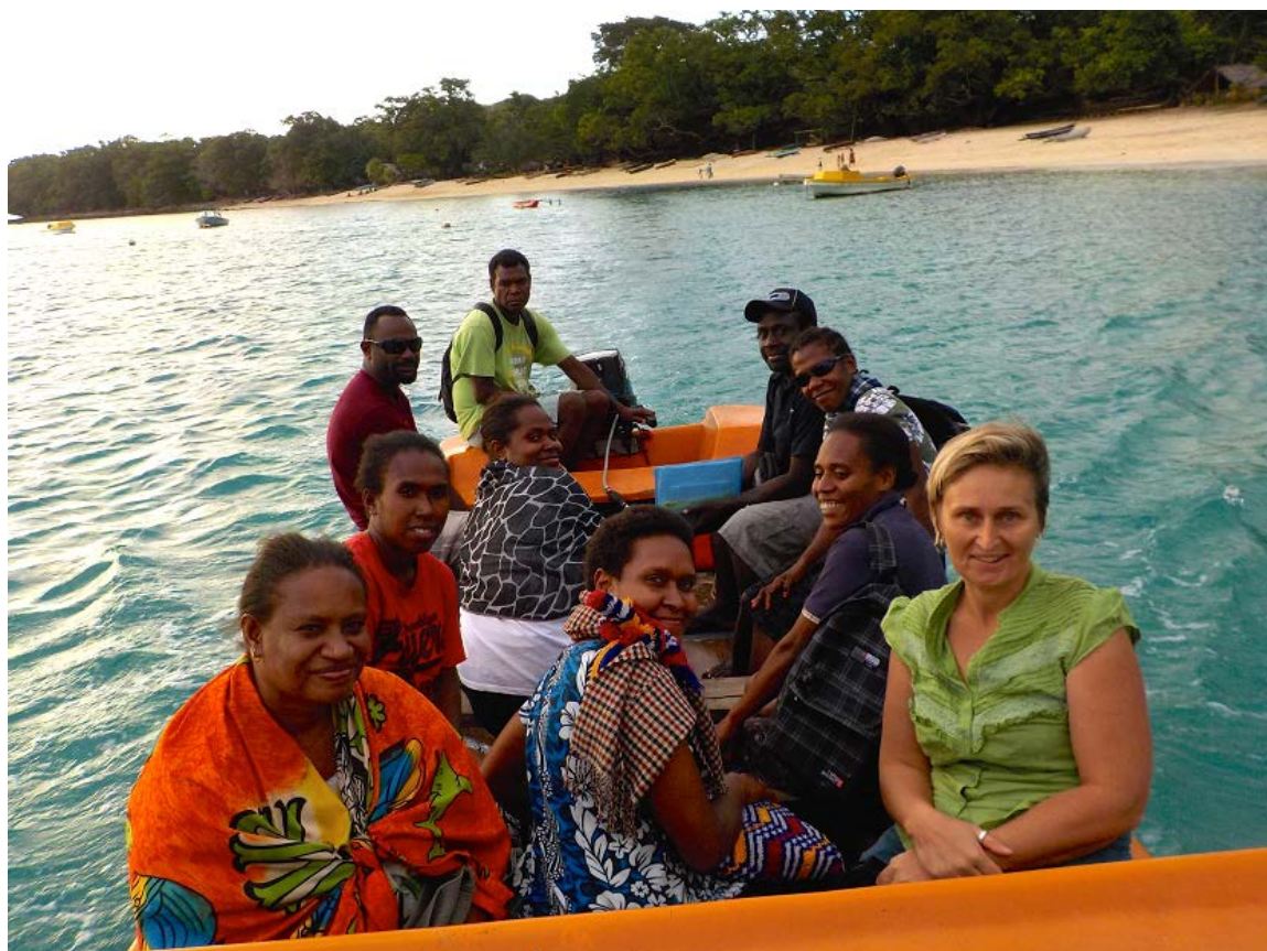
Photo: Researchers travelling around Northwest Malekula.

The focus of 2016 is to consolidate, harmonise and embed program effort over the final year of the program which will require the balancing of the program's breadth and scope, with a full schedule of programmed interventions against the current resources and time; balancing the intensity of effort required to drive change and the necessity for flexibility and responsiveness to circumstances; opportunities and increasing demands by stakeholders. There will additionally be significant focus on the translation of program interventions - be they with respect to learning and development or case and information management systems for example – for the ultimate users or beneficiaries of the services and on the targeted thematic work of component 3 now that the research has been completed.