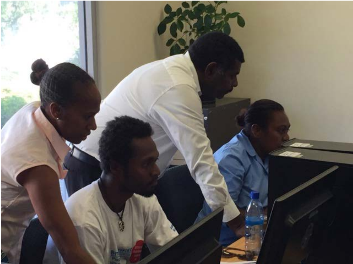
The Chief Registrar of the Supreme Court works with staff on refinements to the new Courts Management System