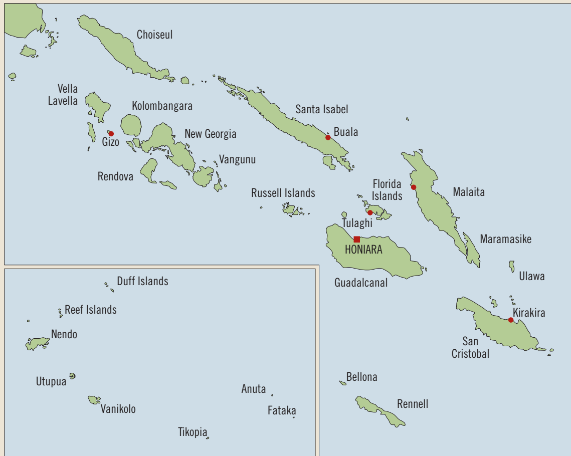
Figure 1 Map of Solomon Islands, showing the main island groups