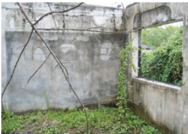
Figure 3 Remains of the Solomon Islands National Agricultural Library

The library was located at the Dodo Creek Research Station outside the capital Honiara. During the ethnic tension in 2000, the library, along with the research station and more than 40 years' worth of information on Solomon Islands agriculture, was destroyed.