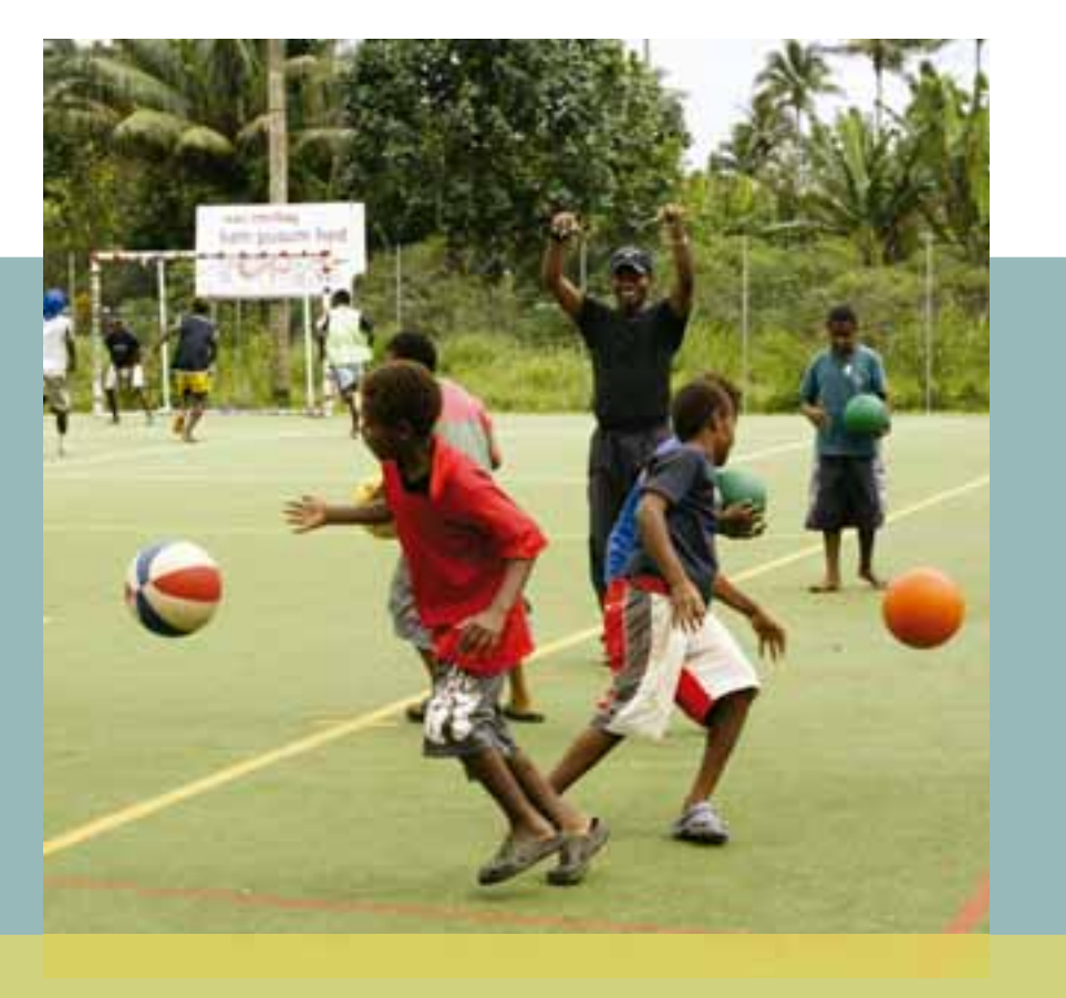
Children and teenagers playing ball games at Wan Smolbag.