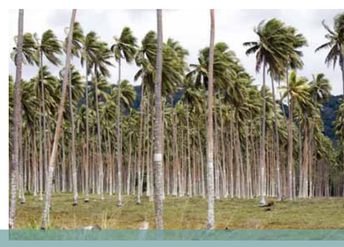
Malekula island coconut plantation.